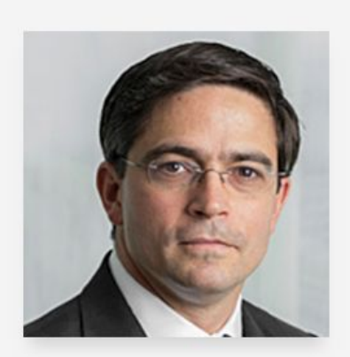
Grégoire Imfeld Pictet & Cie