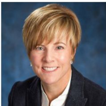
Devra Ochs Ochtree Coaching LLC Denver, CO USA