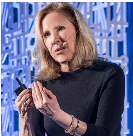
Helen Fisher Chief Scientific Officer for Match.com