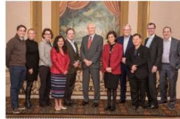
2017 FFI Fellows