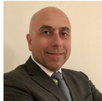
Bilal Zein Quanon Capital Ltd. London, England