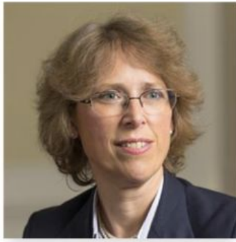
Irene Wolstenholme Coutts & Co. London, England