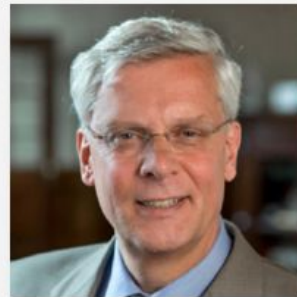
Marnix van Rij