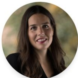
Honora Ducatillon Edmond de Rothschild (Suisse) SA Geneva, Switzerland