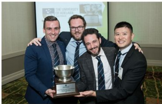
The University of Adelaide