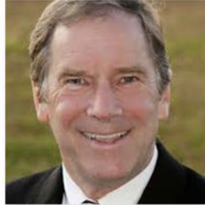
Randy Waesche Resource Management LLC