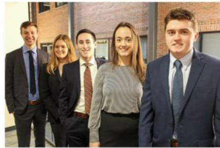
FECC Student Lead Team University of Vermont