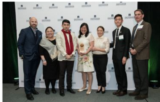
Asian Institute of Management