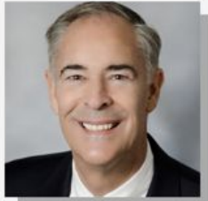
Warner Babcock NYC Family Enterprise Center