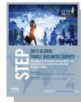
STEP Project 2019 Global Family Business Survey

The International Award recognizes an individual or organization for outstanding achievement in furthering the understanding of family business issues which occur between two or more countries.