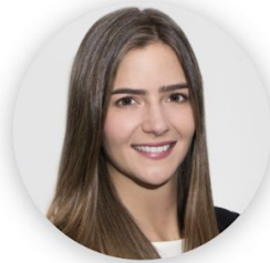
Catalina Arango de Visscher Advisors Scholarship