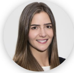
Catalina Arango de Visscher Advisors Scholarship