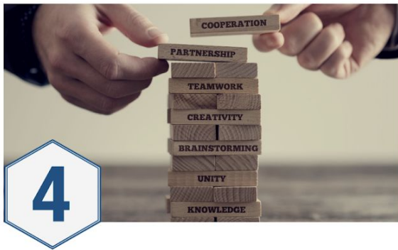
“People Are Loyal to the Culture, Not the Strategy” by Eva Wathén