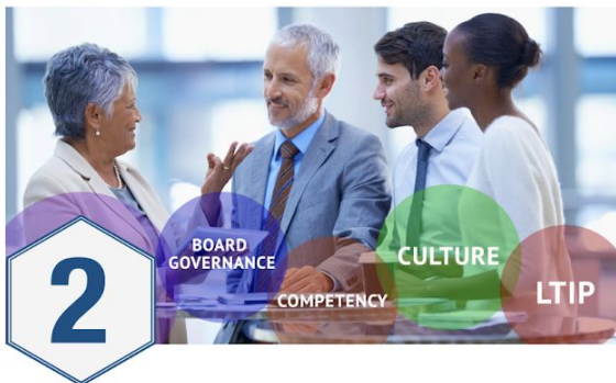
“Letting Go – Five Basics” by Bruce Walton