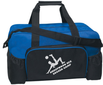
Duffel with water bottle and zipper pockets