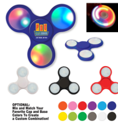
LED Light Up Fidget Spinner