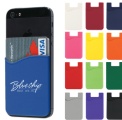
Phone card wallet